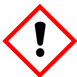
GHS07 Exclamation mark